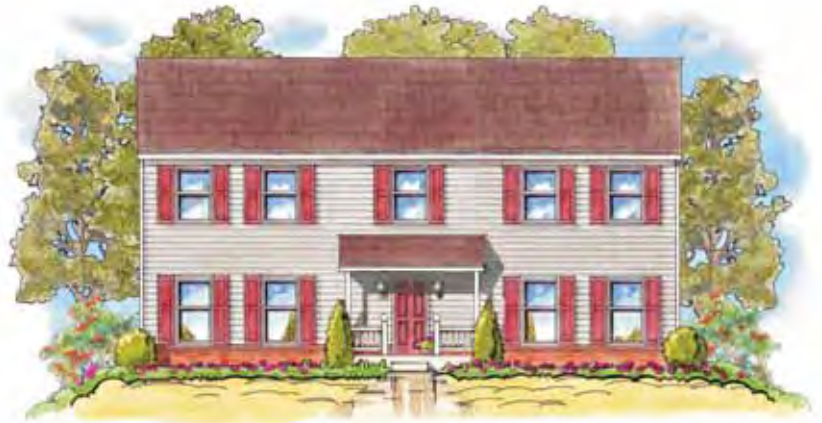
Renderings are for illustration purposes only and may include upgrade options.