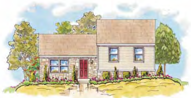
Renderings are for illustration purposes only and may include upgrade options.