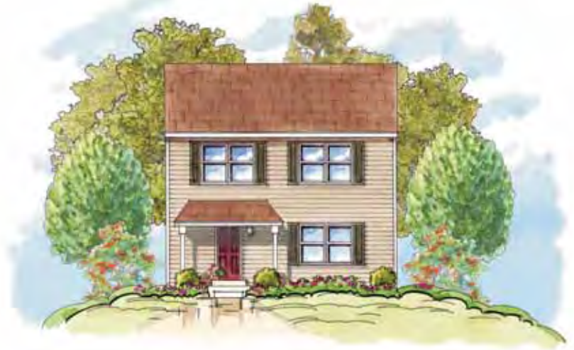
Renderings are for illustration purposes only and may include upgrade options.

T hree sets of double windows on the facade of this cozy two story create a cheery atmosphere. Thoughtful attention has been given to the ease of every day life with a well designed kitchen. Featuring spacious countertops and generous cabinetry, this kitchen will be able to accomodate both gourmet chefs and aspiring cooks alike.