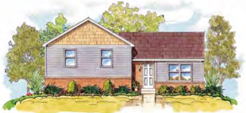
Renderings are for illustration purposes only and may include upgrade options.