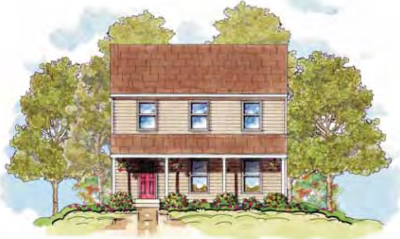
Renderings are for illustration purposes only and may include upgrade options.