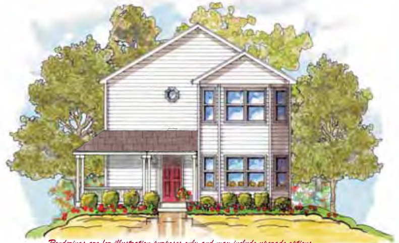
Renderings are for illustration purposes only and may include upgrade options.