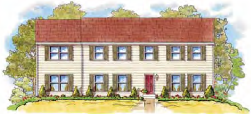
Renderings are for illustration purposes only and may include upgrade options.