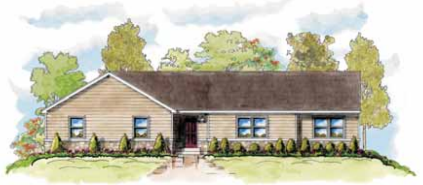
Renderings are for illustration purposes only and may include upgrade options.